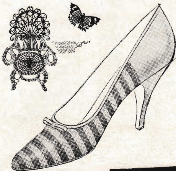
WEAVETTE I 69/11